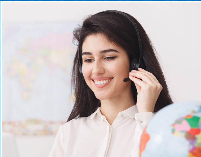
Travel Contact Centre & Operations Support

SkyBook Global provides expert travel outsourcing services, including travel operations, finance & accounting, digital marketing, and IT solutions. We help travel businesses streamline processes, reduce costs, and enhance efficiency with tailored support in back-office operations, customer service, and technology-driven solutions.