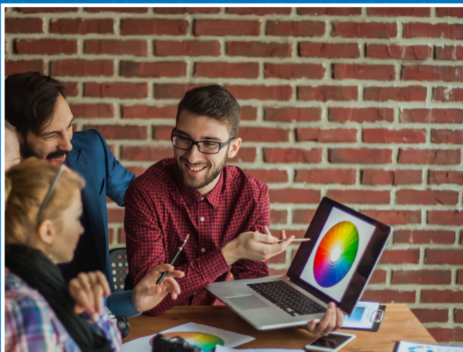
Digital Marketing & Branding for Travel Businesses