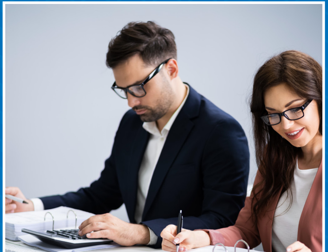
Accounting & Financial Services for Travel & Airline Companies